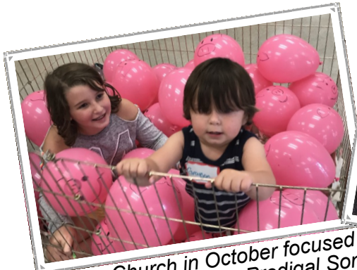
Messy Church in October focused on the Parable of the Prodigal Son. These kids are in the pig pen!