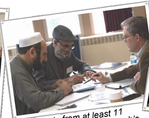
Students from at least 11 countries attend our church's English classes.