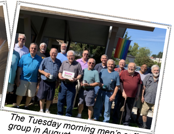
The Tuesday morning men's coffee group in August.