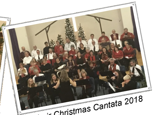
Choir Christmas Cantata 2018