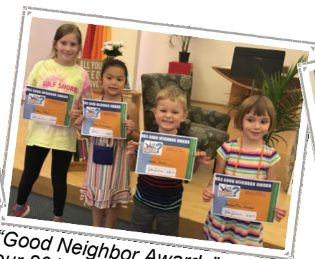
"Good Neighbor Awards" given at our 2019 Vacation Bible School.