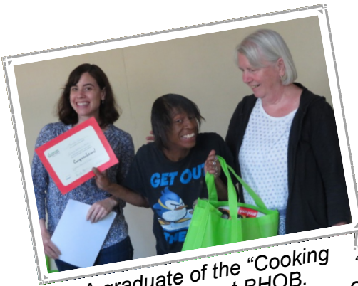
A graduate of the "Cooking Matters" class at BHOB.