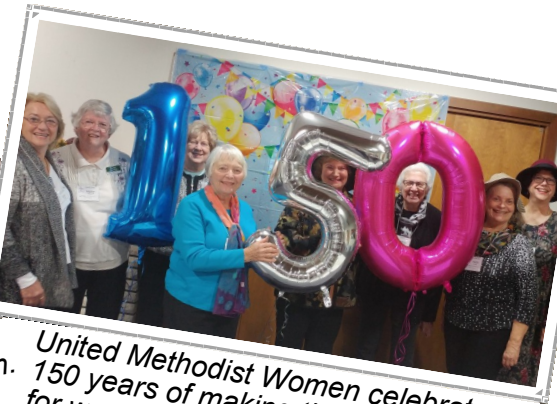
United Methodist Women celebrate 150 years of making the world better for women, children, and youth.