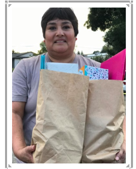
A happy parent at the TUMC school supply distribution event in August

The Tigard UMC Church Council has been in conversation about how the Holy Spirit is leading our congregation into the future. At its annual day retreat on October 5, 2019 the Church Council affirmed that TUMC is called to adapt how it is in ministry with the changing community around the main campus and Bethlehem House of Bread. They noted that the core values most frequently ranked #1 are inclusivity and outreach (with community a very close third). The Council discussed long term objectives for TUMC, including taking intentional steps to engage with a wider demographic in our local area (particularly focused on ethnicity and age) and to amplify our desire to be a community of faith that is fully inclusive of our LGBTQA+ neighbors and friends. How TUMC will meet these objectives is an ongoing conversation with our church leaders.