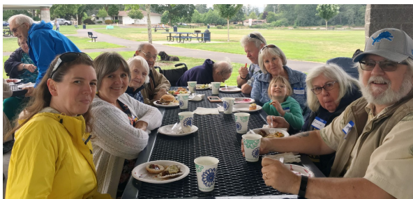
Members of five faith communities gathered this summer for a BBQ in the park... a tangible sign of a new cooperative spirit at work!

New worship experiences provide newcomers with more opportunities to experience worship. Our monthly Messy Church and weekly Vespers services are two recent worship projects that seek to connect more people with God through new expressions of worship. Messy Church has reached several new families and is becoming well-known in the larger