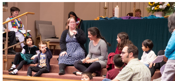
Ministry with children and youth engages entire families with the story of God's love in Christ, on Sunday mornings and throughout the week.

From everyone to whom much has been given, much will be required; and from the one to whom much has been entrusted, even more will be demanded. (Luke 12:48, NRSV)